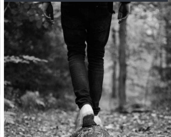
The NeuroCom® Balance Master